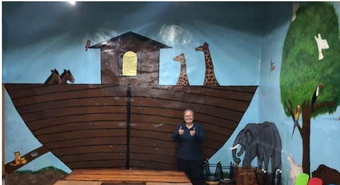
This is in Guanajuato, these drawings were painted by a missionary group from USA that I led back in the late 90's. Still there, still in an excellent state.